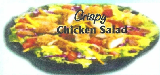
Crispy Chicken Salad

Lettuce, cabbage and tomato topped with crispy chicken breast strips , olives and green onion. 10.50